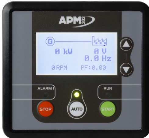
APM303, comprehensive and simple

The APM303 is a versatile unit which can be operated in manual or automatic mode. It offers the following features: Measurements: phase-to-neutral and phase-to-phase voltages, fuel level (In option : active power currents, effective power, power factors, Kw/h energy meter, oil pressure and coolant temperature levels) Supervision: Modbus RTU communication on RS485 Reports: (In option : 2 configurable reports) Safety features: Overspeed, oil pressure, coolant temperatures, minimum and maximum voltage, minimum and maximum frequency (Maximum active power P<66kVA) Traceability: Stack of 12 stored events For further information, please refer to the data sheet for the APM303.